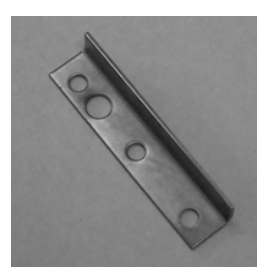
Parking brake bracket